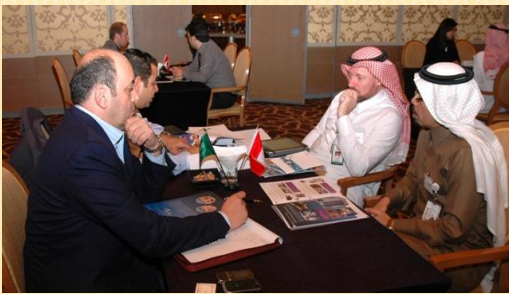
Canadian and Saudi healthcare professionals in private exchange