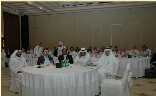
Delegates at the conference listening to the speaker