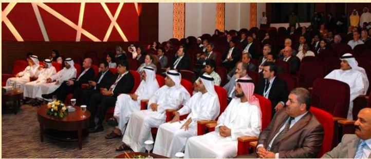
Delegates at the healthcare seminar in Dubai