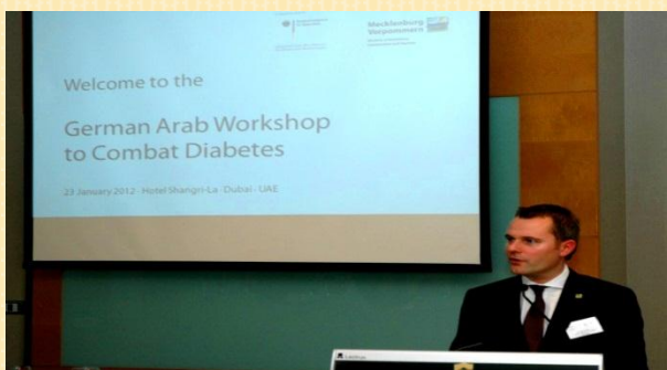
H.E. Daniel Bahr, German Federal Minister of Health, opening the diabetes seminar