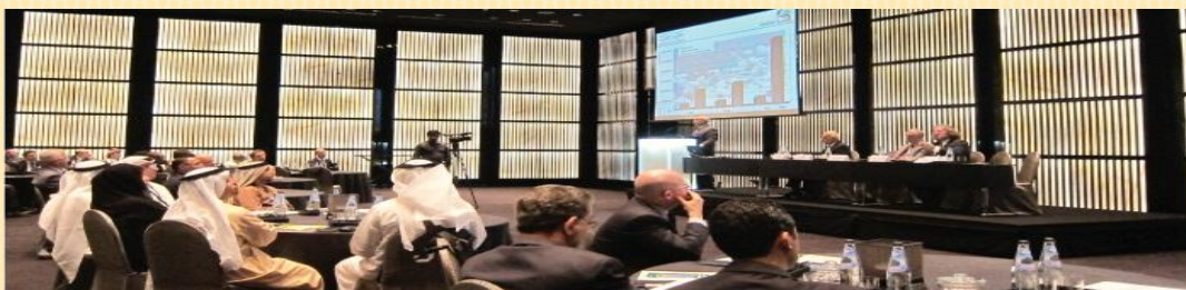
Delegates listening to presentations at the conference at the Armani Hotel