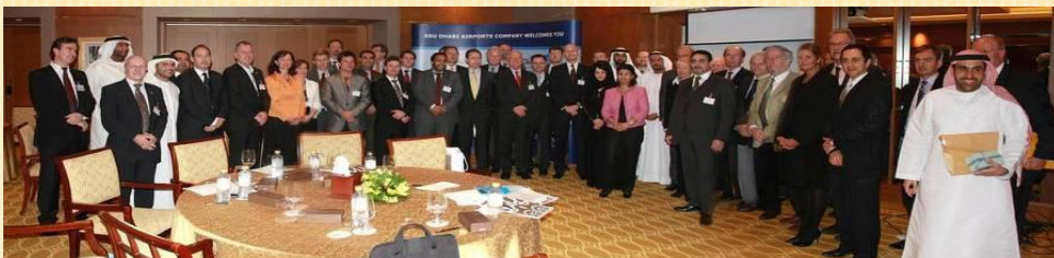
Bavarian delegation at Abu Dhabi Airports Company reception