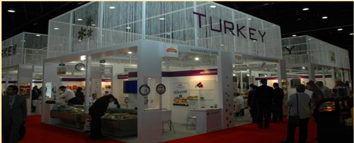
Turkish exhibitors showcasing their products at SIAL Middle EAST