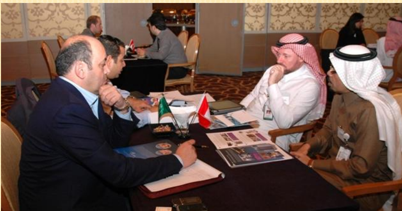
Canadian and Saudi healthcare professionals in private exchange