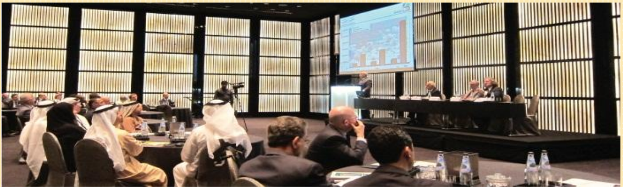
Delegates listening to presentations at the conference