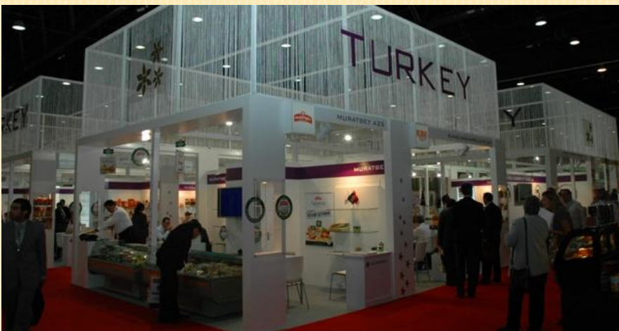
Turkish Country Pavilion at SIAL Middle East 2010