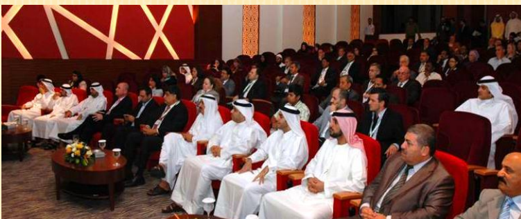
Delegates at the healthcare seminar in Dubai