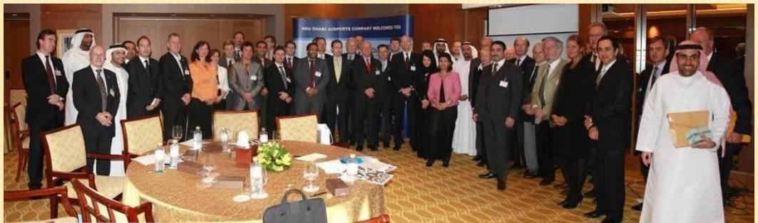
Bavarian delegation at Abu Dhabi Airports Company reception